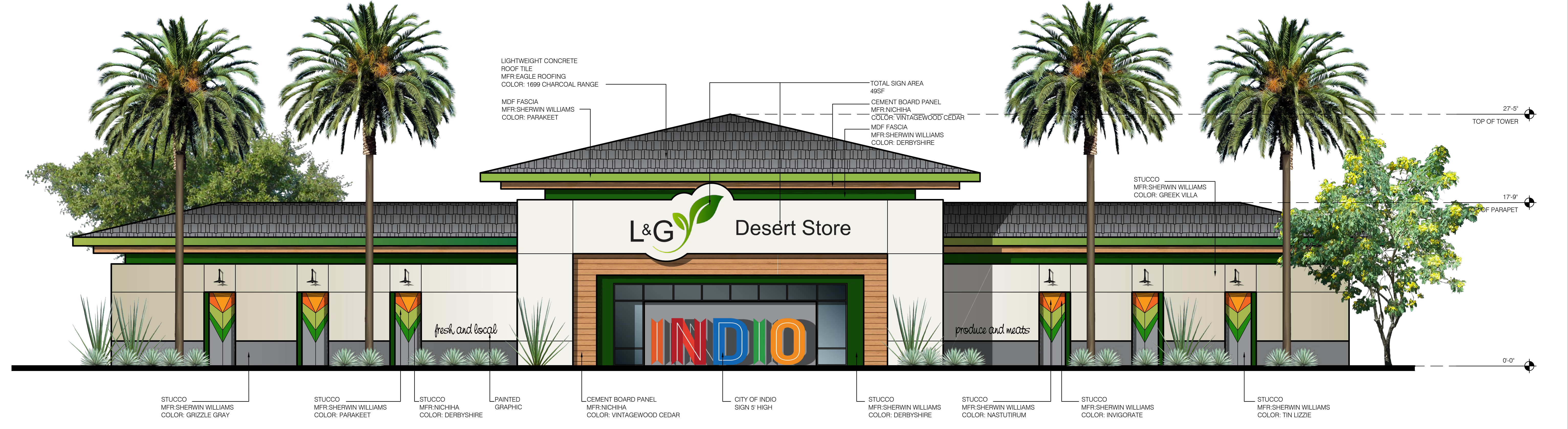
CONVENIENCE STORE STREET ELEVATION (REAR)