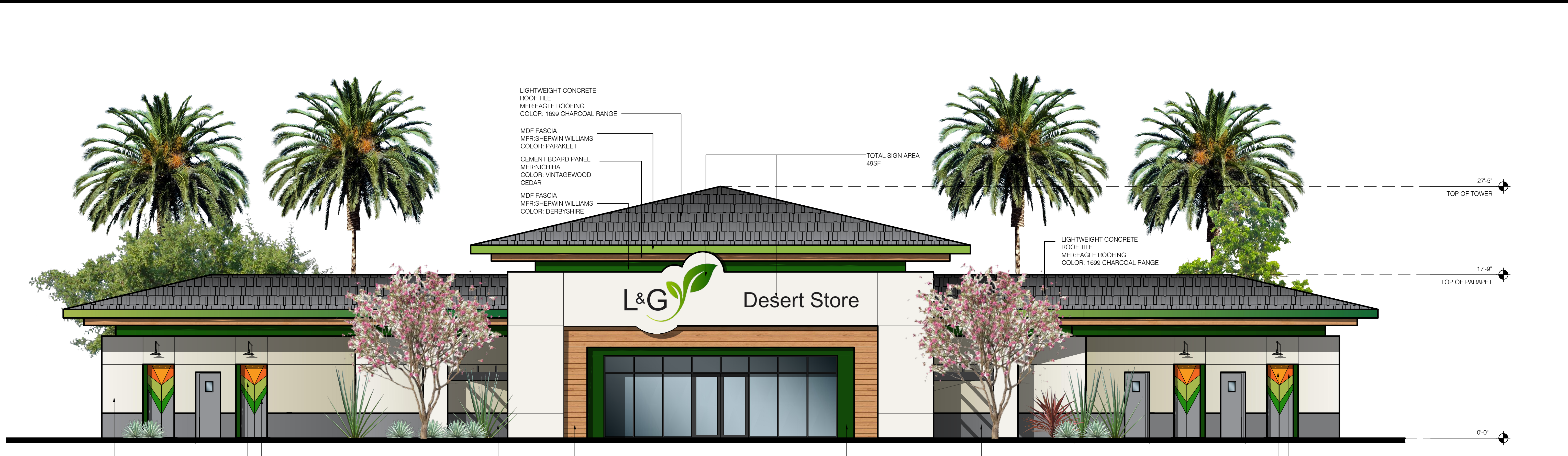
CONVENIENCE STORE ENTRY ELEVATION (FRONT)