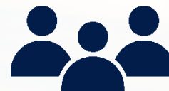
An in-person community workshop

Please visit the City's Consolidated Plan webpage to subscribe to the project mailing list to be notified of upcoming opportunities. Events will also be posted on the City's live calendar.