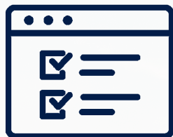
A community needs survey

Over the next few months, Indio residents will be encouraged to share their needs and priorities through virtual and in-person community forums, including: