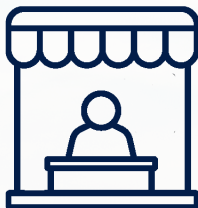
An in-person pop-up at an existing community event