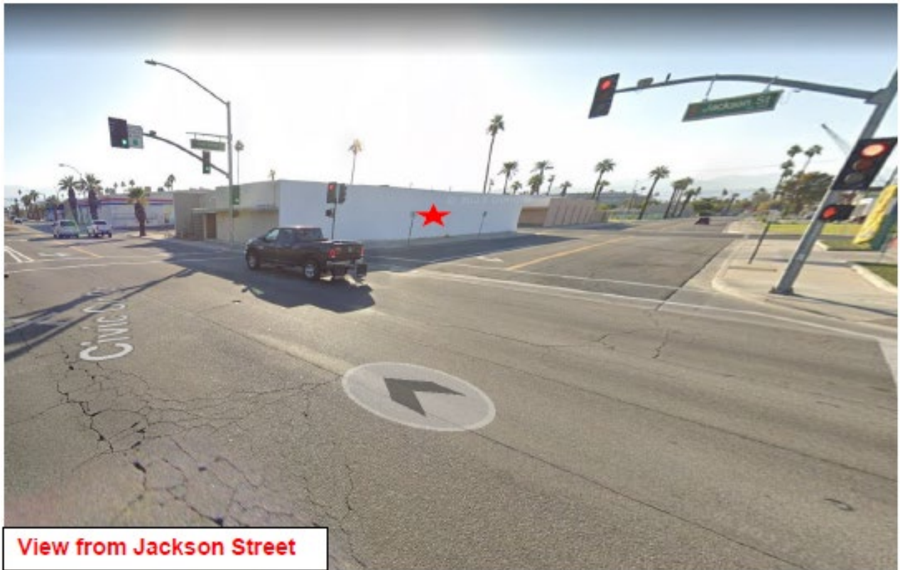
View from Jackson Street