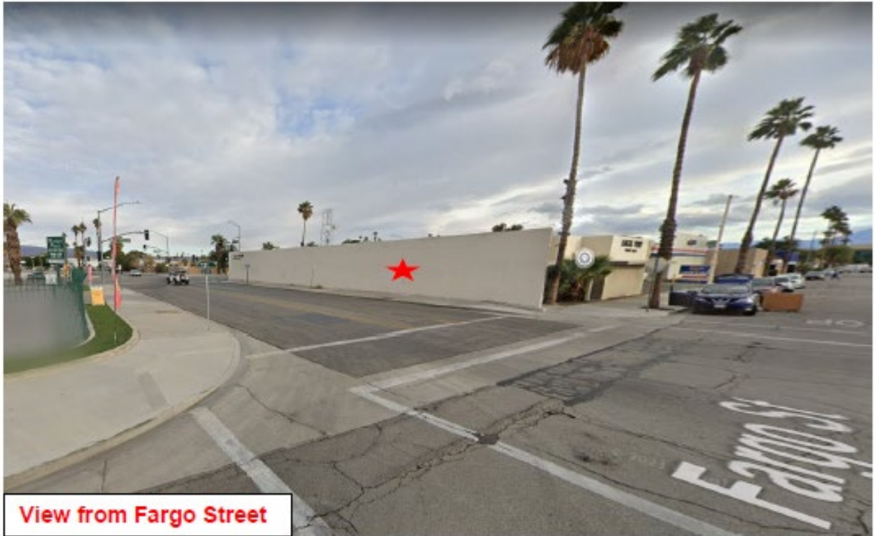
View from Fargo Street